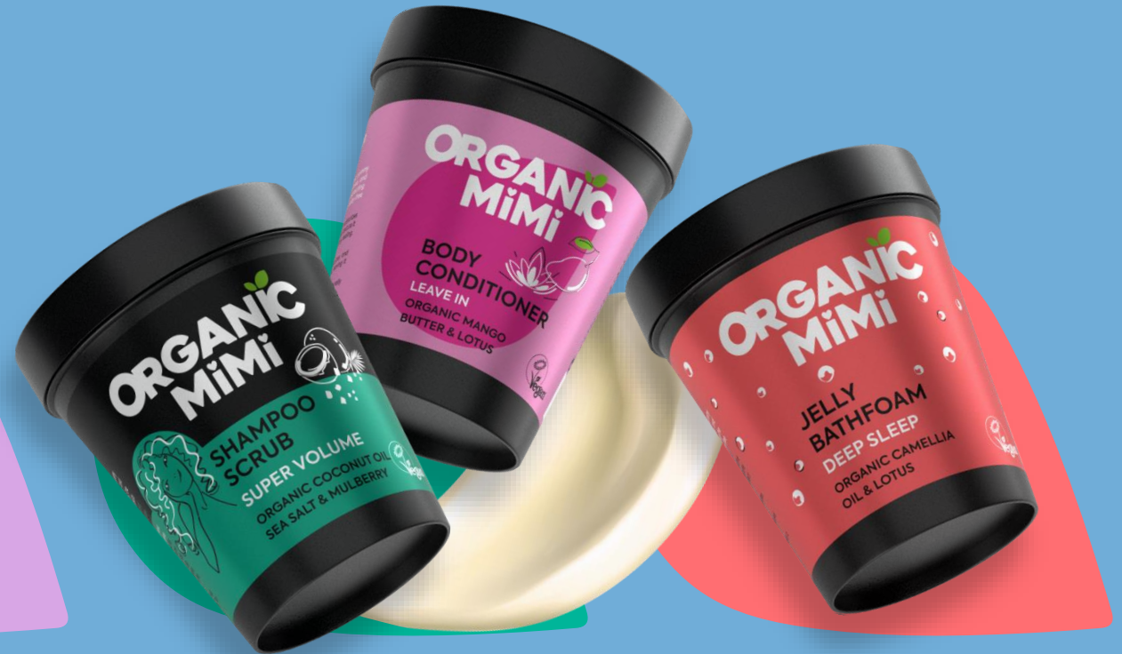
HAIR CARE 6 SKU