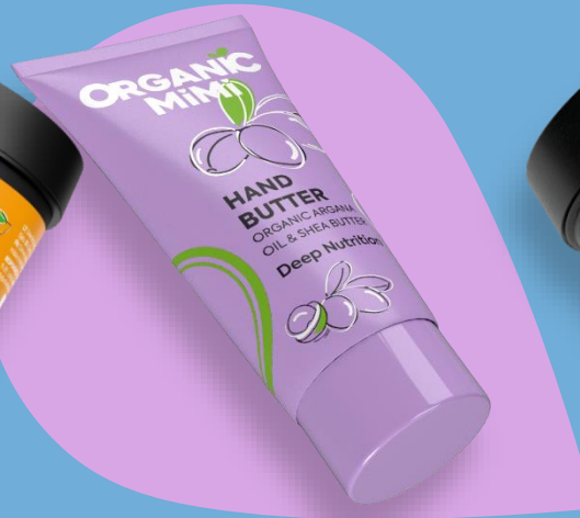
HAND & FOOT CARE 10 SKU