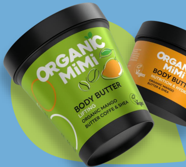
BODY CARE 41 SKU