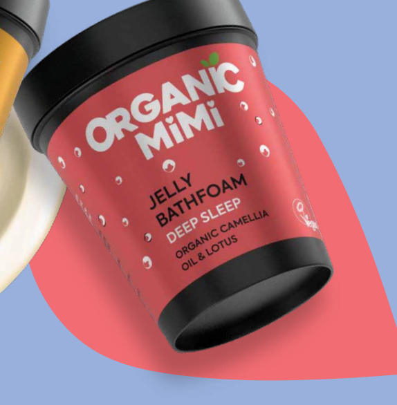
BODY CARE 41 SKU